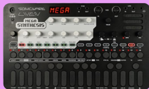
Explore The Sounds Of The Sega Genesis W/ 3 FM, 2 PSG and 1 PCM Tracks On The MEGA Synthesis