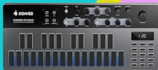
Learn Bass Sequencing On The B1