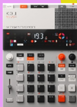
Build Tracks Using Built-In Samples And Effects On The K.O. II

You Only Need To Bring Your 3.5mm WIRED HEADPHONES!