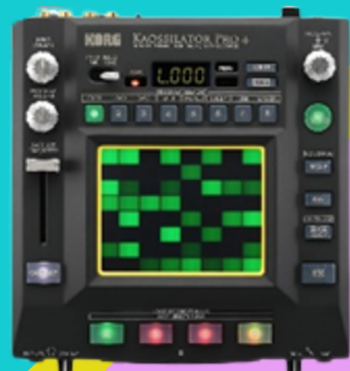
The KAOSSILLATOR PRO: 4-Track Touch Synth With Key/Scale Settings