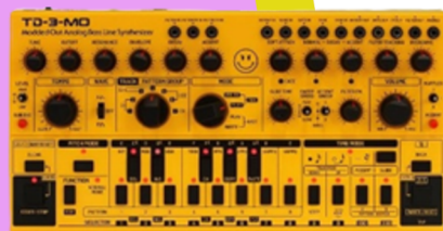
Step-Up To The TD-3-MO