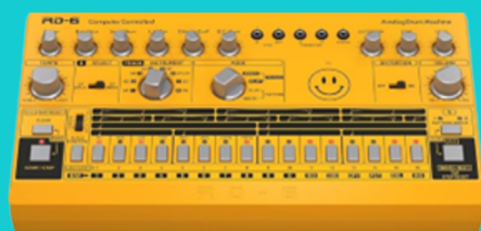
Learn Analog Drums With The RD6

Get Hands On With Classic Analog Drum & Bass Sequencers, Synth & Sampler