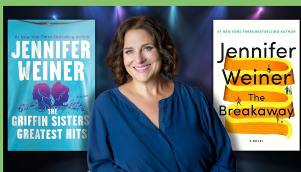
Novelist Jennifer Weiner

Dreams We Chase Wednesday, March 26th at 7:00 PM EDT